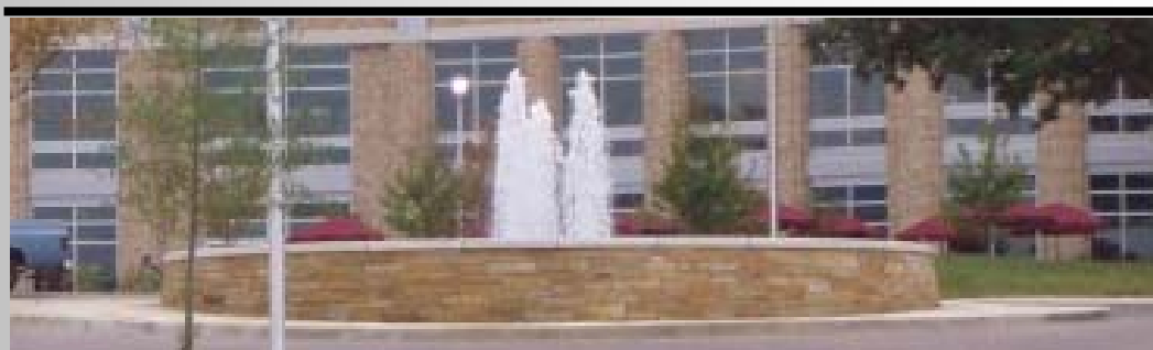
Right: Fountain in front of Student Union

Suffice it to say that this was a very busy summer and my hat is off to all you for your involvement and efforts in the positive changes of this campus. I hope each of you have enjoyed your involvement in all of these activities. Every single person's contribution is a valuable part of the success of the university.