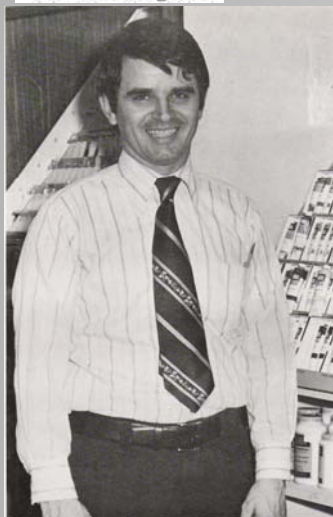
Guess who! Do you know this FM employee? Email answers to: jmiller@astate.edu